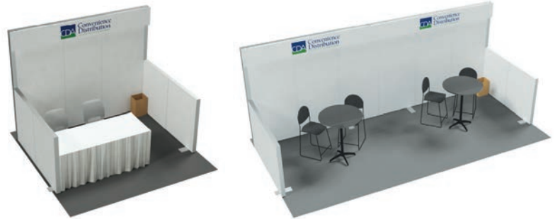
10' x 10' and 10' x 20' booth samples shown (Exhibitor-submitted graphics are applied across header)