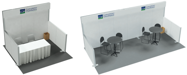
10' x 10' and 10' x 20' booth samples shown (Exhibitor-submitted graphics are applied across header!)