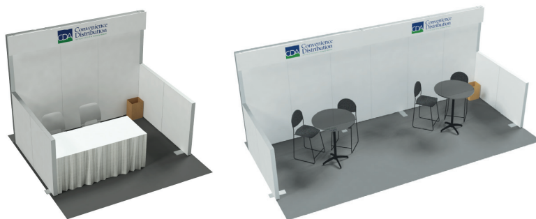
10' x 10' and 10' x 20' booth samples shown (Exhibitor-submitted graphics are applied across header!)