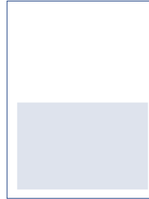
1/2 Horizontal 7" x 4.875"